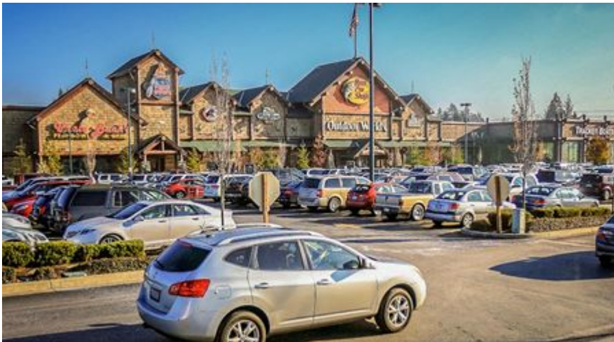
Example of large-scale auto-oriented commercial development found within C-2 (general commercial) zoning

Furthermore, it is evident that there are broad differences in the typology of urban form of areas within a single commercial zoning classification. For example, C-2 General Commercial zoning produces commercial development patterns as varied as the Bass Pro Shops on S. Hosmer Street and the commercial area in Old Town on N. 30 th Street.