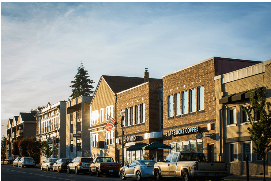
Example of a neighborhood-scale pedestrian-oriented commercial area (with residential) found within C-2 (general commercial) zoning

Updating code within a single zoning designation to address the desired design standards between these varied contexts is challenging. Furthermore, under the current guidelines, areas serving as desirable pedestrian-friendly commercial areas (many with historic building stock) could be redeveloped, without any zoning change, into auto-oriented or (in some cases) even completely residential uses. A thorough review of the City’s commercial zoning standards could produce a code that is streamlined and targeted, thus implementing the FLUM, goals, and policies within the One Tacoma Plan .